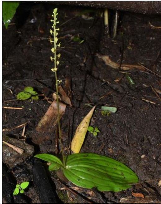
Figure 2. C. mackinnonii (Duthie) Szlach. Habit (Plant 2)