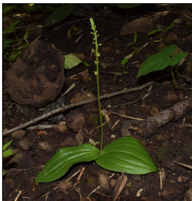
Figure 1. Crepidium mackinnonii (Duthie) Szlach. Habit (Plant 1)

Habit Small, annual, erect terrestrial herb, height ca. 20 cm. Tuber small, ovoid, corm-like, 7-10 mm, whitish, covered with sheaths. Leaves 2-3, flat on the ground, opposite to subopposite, sessile, cordate-amplexicaule at base, lamina 4-9 × 2-6 cm, entire, variable in shape, oblong-lanceolate, elliptic, ovate-lanceolate, broadly ovate-suborbicular, acute or obtuse, prominently nerved, nerves 5-9. Scape along with inflorescence, ca. 20 cm long, erect, angled. Inflorescence a many-flowered lax-raceme. Flowers non-resupinate, 4-5 mm across, yellowish green, pedicellate. Bracts 5 × 1-1.5 mm, deflexed, sub-acuminate or acute, 1-nerved, almost invisible. Sepals 2.5 × 1.5 mm, reflexed, elliptic-ovate or oblong, 3-nerved, yellowish green. Petals 2-3 mm long, reflexed, linear or linear-lanceolate to filiform, normally not visible in the flower. Labellum 5-6 mm, superior, yellowish-green, ovate-oblong, somewhat constricted just beyond the middle, obscurely 3-lobed, with basal auricles; auricles falcate, narrowly ovate-oblong or lanceolate, obtuse or acute, concave in the middle about the attachment of the column, again convex on the sides outwards; the apical part broadly ovate-oblong, slightly curved forward, somewhat hooded, bilobed at the apex with a narrow sinus in between. Column about 1 mm, stout, pale yellow, with two fleshy arms. Capsules not observed.