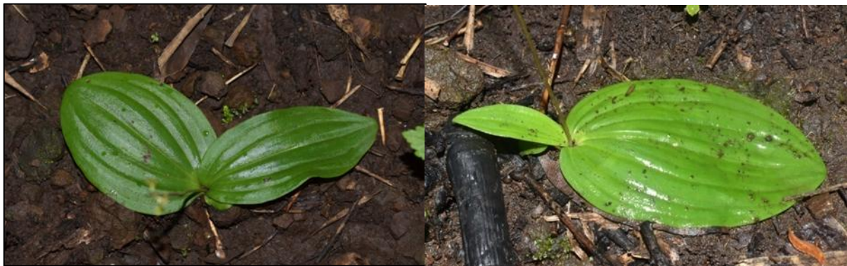
Figure 3. Variably shaped leaves.