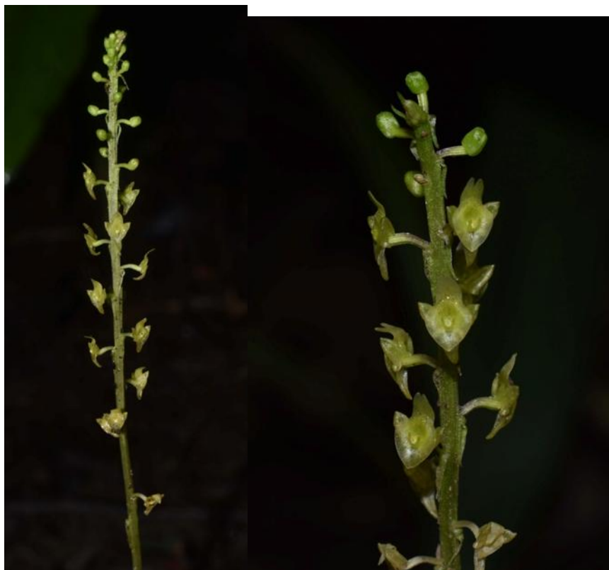
Figure.4 & 5. C. mackinnonii (Duthie) Szlach. Inflorescence.