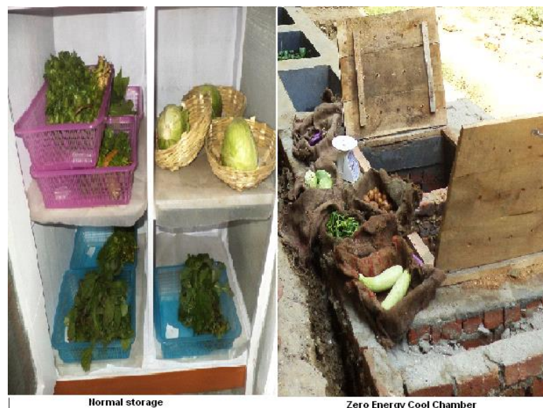
Figure 1: Normal and zero cool chamber

conditions. The cold water treatment decreases the temperature and slow the metabolic activity of fresh cut leafy vegetables and when these pre cooled vegetables were kept in cool chamber, increase the shelf life and maintain the organoleptic properties.