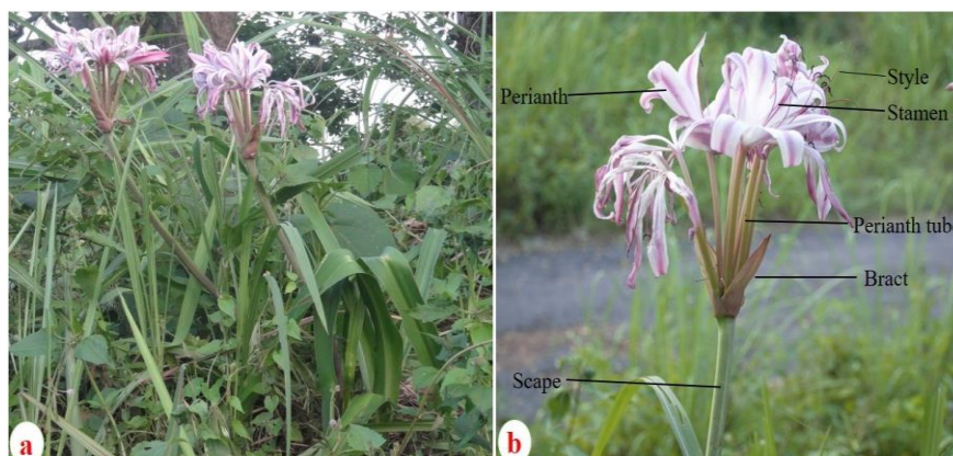
Plate 2: Crinum latifolium L.: a- Habitat; b-: Different floral parts

Uses: Leaves are used for the treatment of tumor, piles and fistula and earache. Tribal traditional healers believe C. latifolium extend life span.