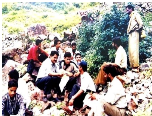
Fig. 1. Group discussion by author

Roots are crushed to prepare paste. The paste is taken with water for five days- Irregular menstruation, Menorrhoea.