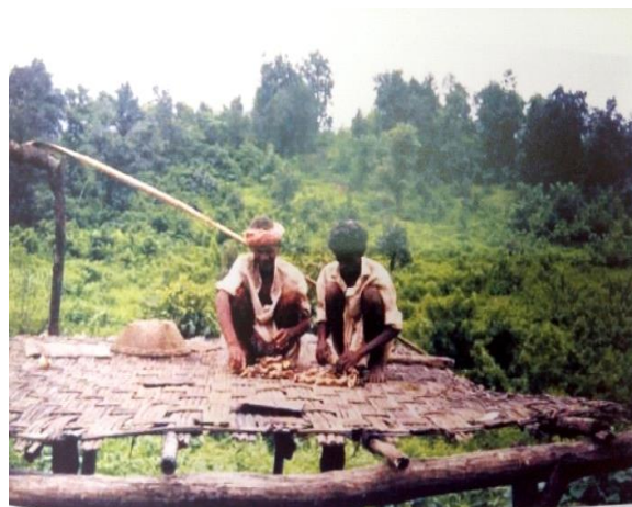
Fig. 2. Traditional method of drying herbal medicine