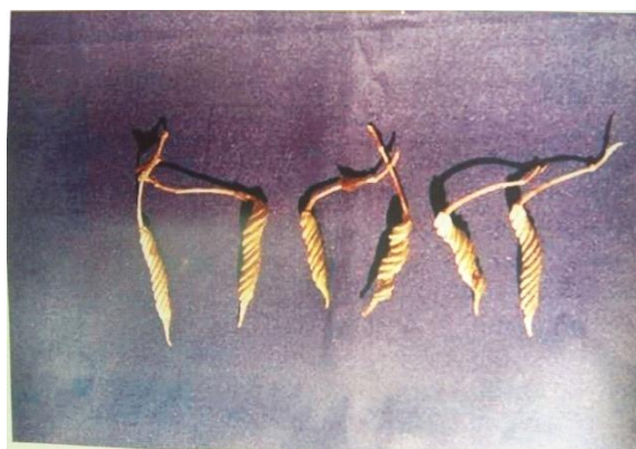
Fig. 3. Fruits of Helicteris isora (Marod phalli)