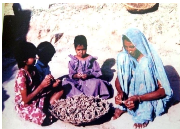
Fig. 4. Childrens with mother engaged to separate herbal medicine