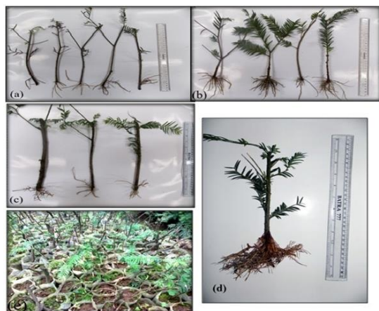
Figure 2. Taxus baccata cuttings (a) Rooted cuttings of first year shoots during rainy season (b) Rooted cuttings of second year shoots during rainy season (c) Rooted cuttings of third year shoots during rainy season (d) A well rooted 16 months old, second year shoot (e) Rooted plants transplanted in open condition for acclimatization

The effect of IBA treatment on rooting of Taxus baccata cuttings varied with season. Lower concentrations of IBA (0-1000 ppm) effectively induced rooting of cutting during spring and rainy seasons, whereas rooting of cuttings in autumn and winter only took place when treated with higher concentrations ( \geq 3000 ppm). So it can be said that that an annual rhythmic change in rooting response of Taxus baccata stem cuttings existed. Generally plants are active during the spring and rainy seasons and the level of endogenous auxin was supposed to be high due to its meristematic activity. During these seasons, optimally low doses of IBA can induce profuse rooting in cutting. On the other hand, higher concentrations of exogenous auxin (IBA) proved to be detrimental rather than beneficial because the entire auxin concentration is raised to supra optimal level. After rainy, application of higher doses of (IBA more than 3000 ppm) proved helpful for root initiation in cuttings. The inhibitory effect of higher concentration on rooting however could have decreased gradually with decreasing temperature, causing a slowdown in the meristematic activity, so that application of exogenously applied auxins might raise