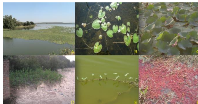
Figure 2. A-View of lake, B- Nymphoides cristata , C- Nymphaea nouchali , D- Ipomoea carnea , E- Ipomoea aquatica F, Azolla pinnata

many as 16 plants 9 species are free floating, 4 species are submerged hydrophytes, 1 species is emergent type and 2 species are marginal hydrophytes (Figure 3, Table 3). The dominant families are Nymphaeaceae, Hydrocharitaceae and Araceae (2 species each) Table 2).