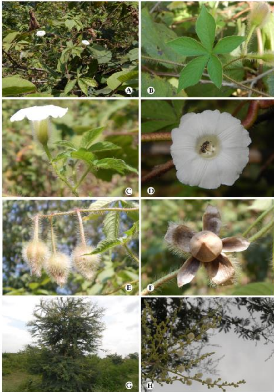
Fig. 1: A-F. Merremia aegyptia (L.) Urb.: A. Habit, B. Leaf, C & D. flower side and front views, E. young fruits, F. matured fruit; G-H. Vachellia leucophloea (Roxb.) Maslin: G. Habit, H. inflorescence.

Note: Genus Vachellia is characterized by stipular spines at nodes that can either be straight, deflexed or weakly falcate. Haines reported this plant from Odisha (from Balasore and Cuttack to Sambalpur).